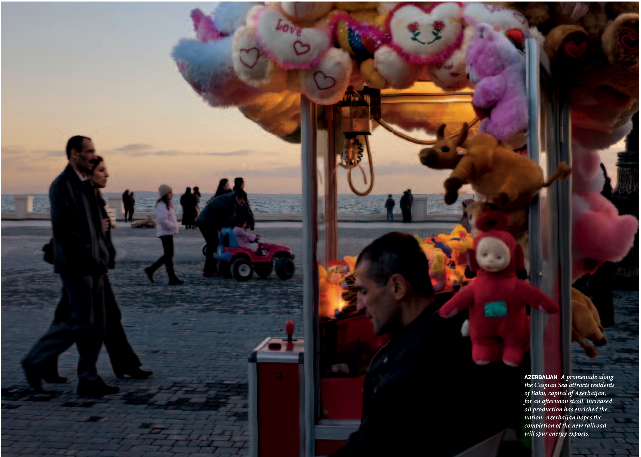
AZERBAIJAN A promenade along the Caspian Sea attracts residents of Baku, capital of Azerbaijan, for an afternoon stroll. Increased oil production has enriched the nation; Azerbaijan hopes the completion of the new railroad will spur energy exports.