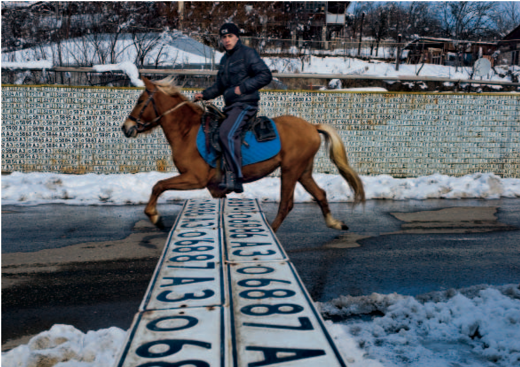
NAGORNO-KARABAKH The license plates were taken from cars abandoned by Azerbaijanis fleeing their homes as Armenia and Azerbaijan fought over control of the region in the early 1990s. Now they line roadside walls in the town of Vank and are seen as trophies of victory.

at the opening of the 20th century. But it feels like it does.