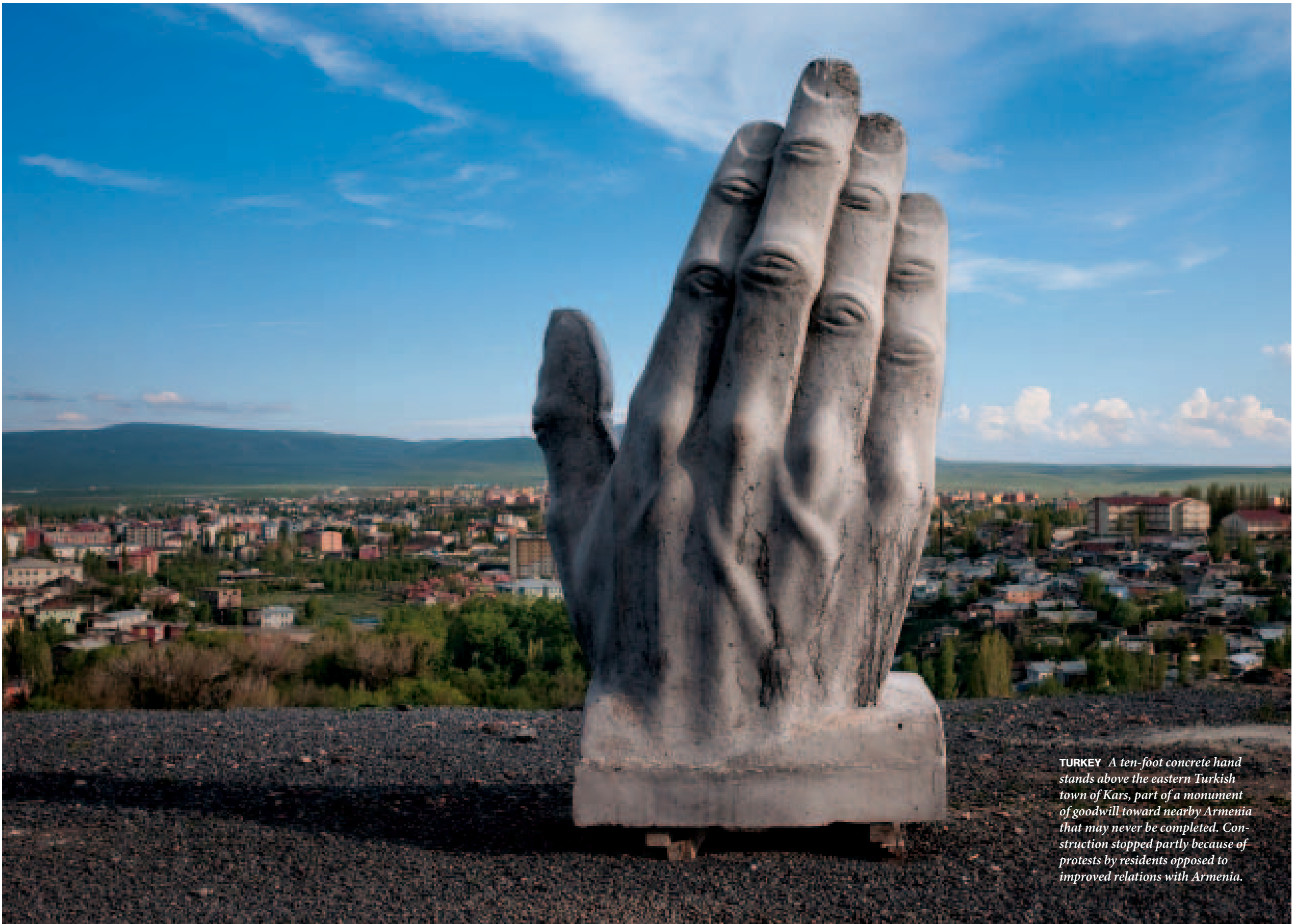
TURKEY A ten-foot concrete hand stands above the eastern Turkish town of Kars, part of a monument of goodwill toward nearby Armenia that may never be completed. Construction stopped partly because of protests by residents opposed to improved relations with Armenia.