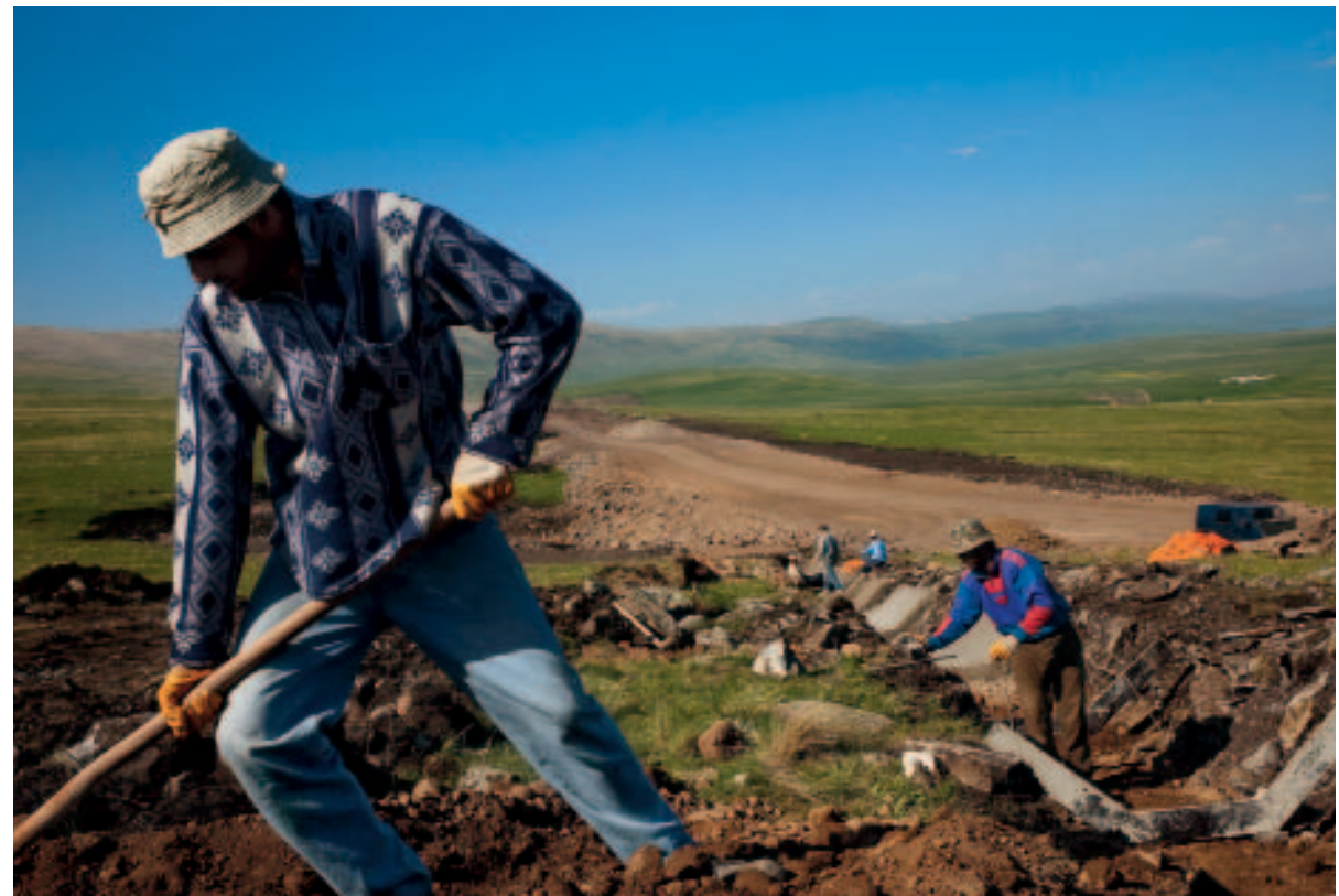
GEORGIA The railway provides work for many, including these men digging a drainage ditch along a freshly cleared railbed between Akhalkalaki and the Turkish border. Georgians (left) make the morning commute from the capital, Tbilisi, to jobs in nearby Rustavi in the existing railway's faded cars.

Looking directly east, Turkey has lately sought to repair relations with its neighbor Armenia. In 1993 it had closed the border and shut down its rail service with Armenia as a sign of loyalty to Azerbaijan—a close Turkish ally with the same Muslim religion—after Christian Armenia helped ethnic Armenians in the Azerbaijan enclave of Nagorno-Karabakh wage a bloody war to secede. Last year in Zurich, under the watchful eyes of the EU and the U.S., Turkey signed an agreement with Armenia to mend diplomatic ties and reopen the border. But the Armenians then demanded that Turkey acknowledge that the 1915 massacres of its people constituted genocide, which Turkey is loath to do. For their part, the Turks began insisting on some resolution to the Nagorno-Karabakh conflict. Since neither is likely to happen anytime soon, the