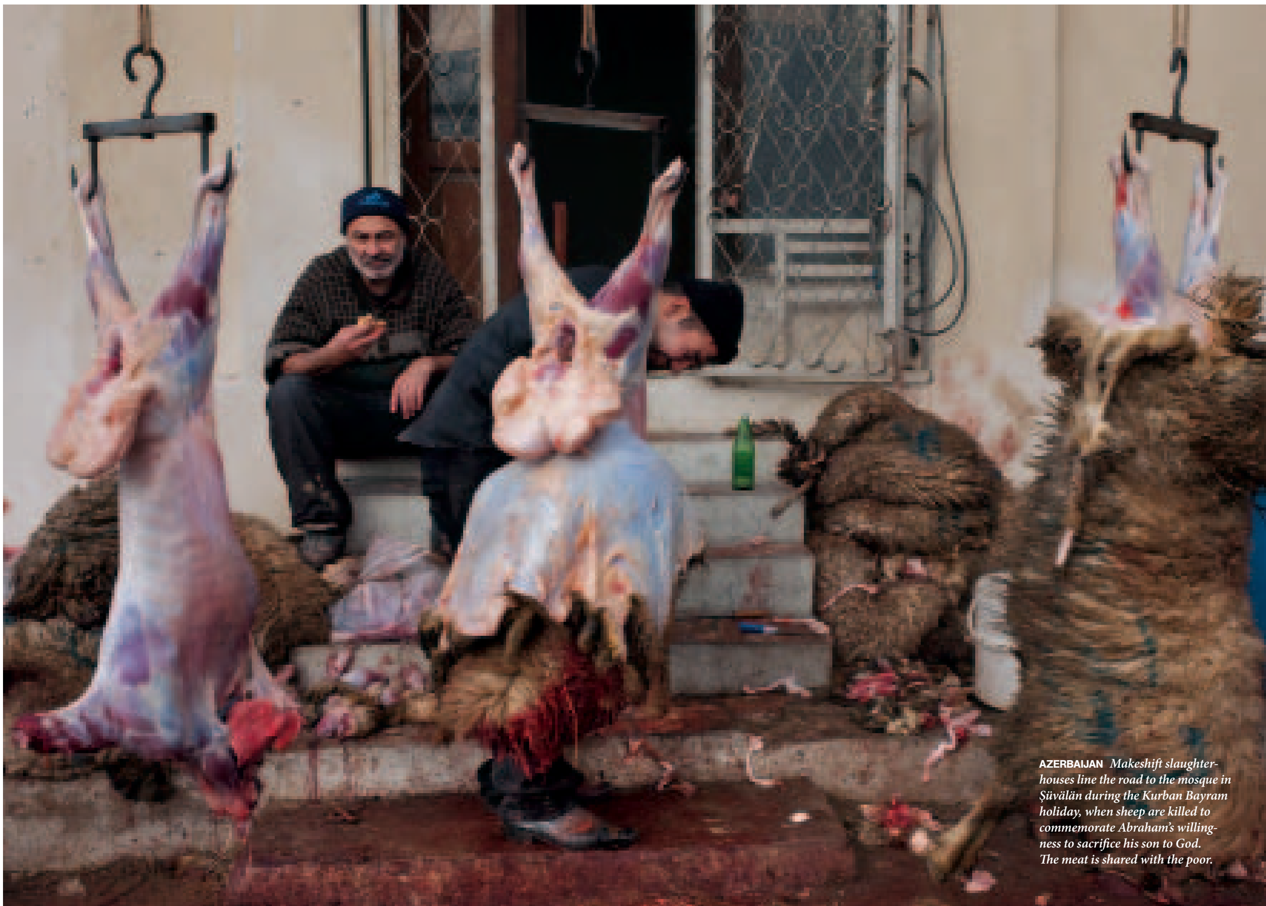
AZERBAIJAN Makeshift slaughterhouses line the road to the mosque in Şüvälän during the Kurban Bayram holiday, when sheep are killed to commemorate Abraham's willingness to sacrifice his son to God. The meat is shared with the poor.